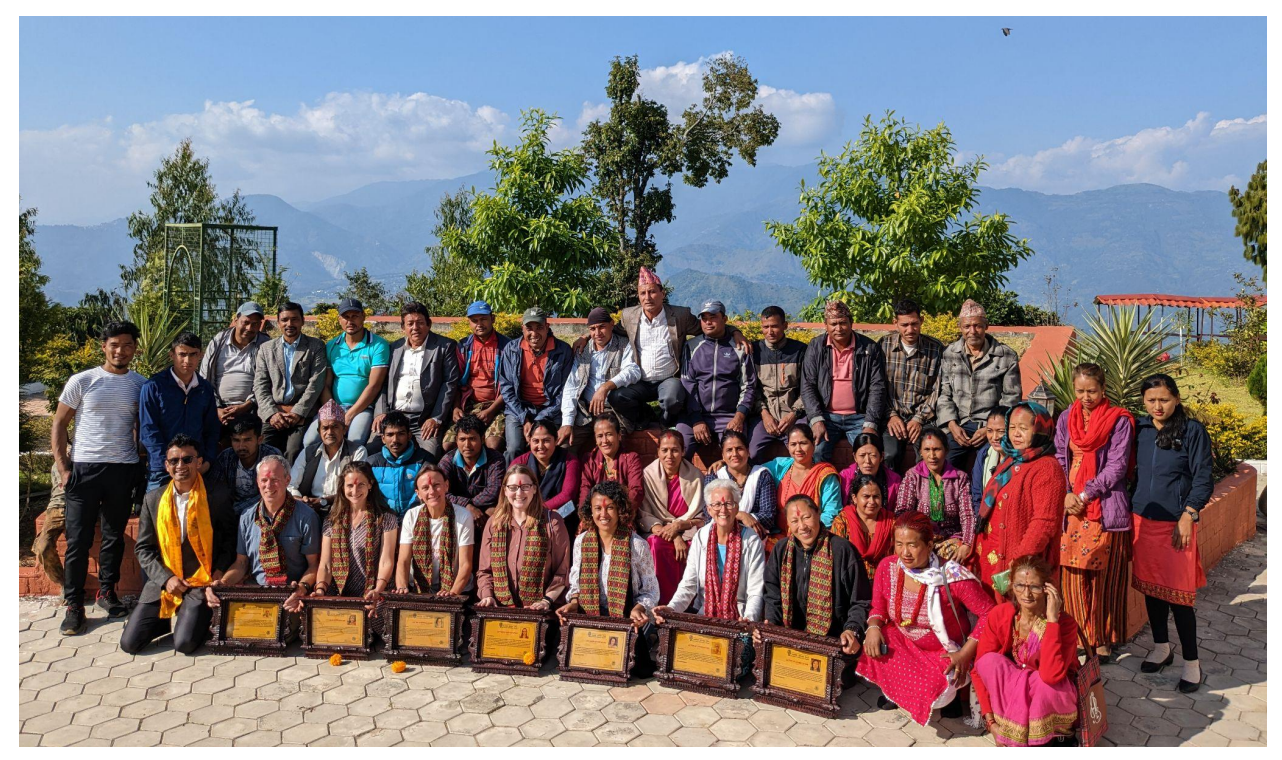
*Meeting with community stakeholders during the FoVIN Nepal Summit, where beneficiaries, farmers, teachers, students, families, women entrepreneurs, and other stakeholders came to share their thoughts and ideas, concerns, requests, and gratitude with VIN and FoVIN.

*Six young women at the Naratika CLC's computer learning lab, learning computer skills on the iPads we brought in October 2022. VIN added the wireless keyboards, mouses, and stands.